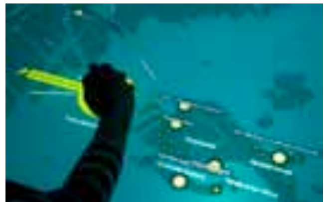
Figure 3. Exploring relations between projects

position so as to not interfere with the facet item selection (which is at West). Keeping the same interaction mechanism, users select a category by moving the object towards its respective orientation. By rotating the object inside the ring users can explore project information in detail: scrolling through the descriptive text, and browsing through explanatory pictures (Figure 2 c). Selection of the third category (“relations”) activates the project's conceptual network with other projects (Figure 3).