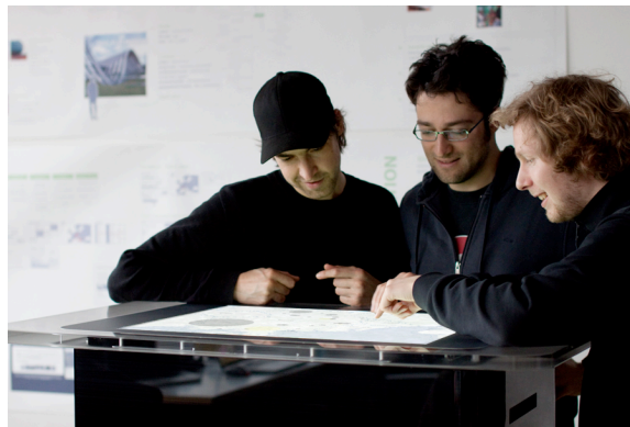
Fig. 2. Users exploring institutions with the tabletop prototype.

With the large interactive surface, the user not only views and manipulates data on a single user system, but operates in a collaboratively created and used information space (see Fig. 2). In this setting, co-located users, who may or may not be associated with each other, explore the visualization together. Users can arrive or leave at any time, and have the ability to interact as an individual, or as a member of a group with similar interests, goals or attitudes. Cooperative interaction can involve periods of tightly coupled activities by groups with similar but diverging goals, alternated with more loosely coupled individual work. Such collaborative threads can close, split off and merge repeatedly.